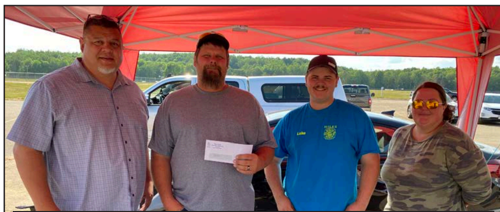
Town of Hiles: Establish a Rescue Dive Team within the county with proper training and equipment