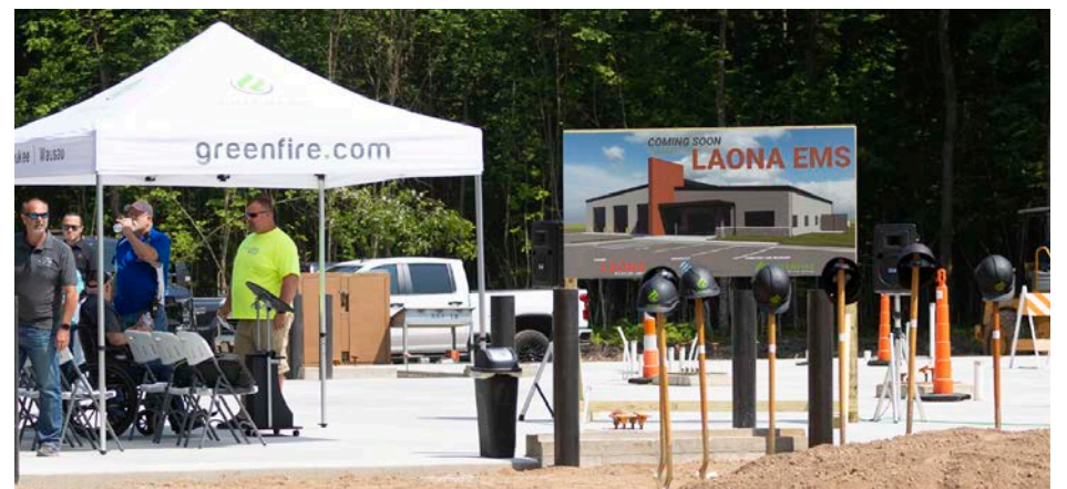
Future site for the Laona EMS building.