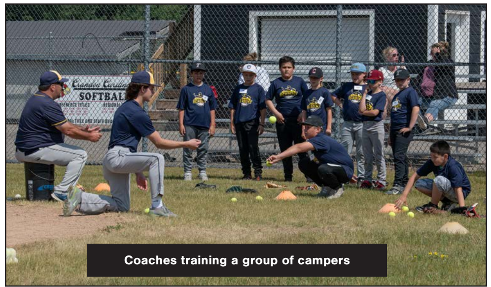
Coaches training a group of campers