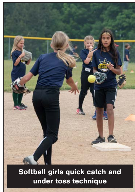
Softball girls quick catch and under toss technique