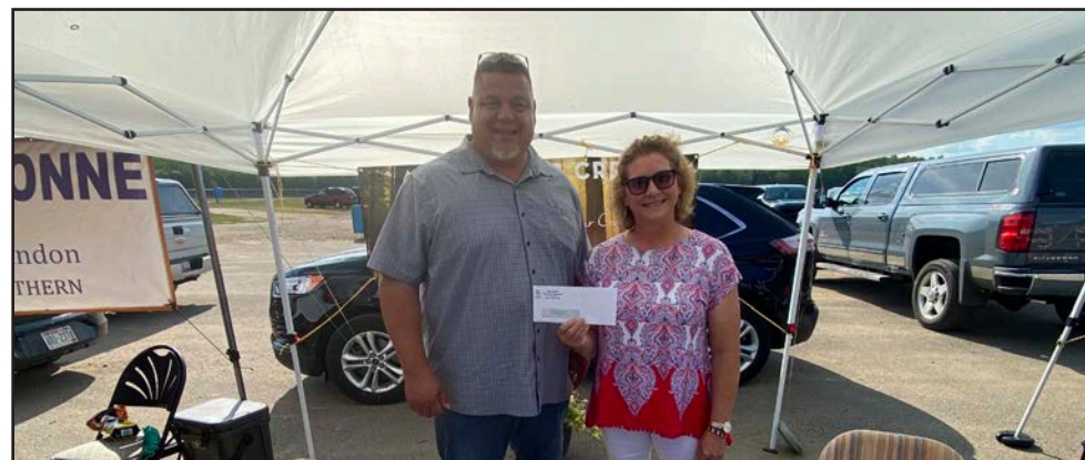
Town of Armstrong Creek: New road signs and replace old water fountain at town park