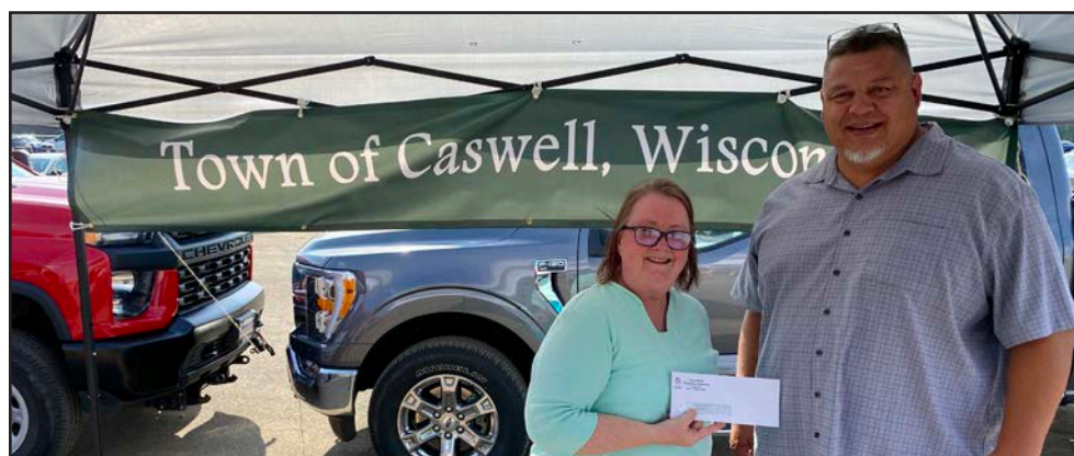
Town of Caswell: New chairs and upgrades to the town hall and replacement of road signs