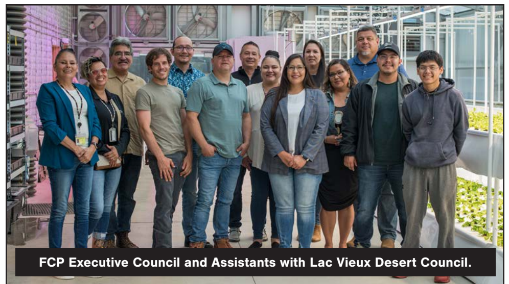
FCP Executive Council and Assistants with Lac Vieux Desert Council.

The group ended the day with a little visit to the gift shop, purchasing a variety of meats, gifts and treasures to take home.