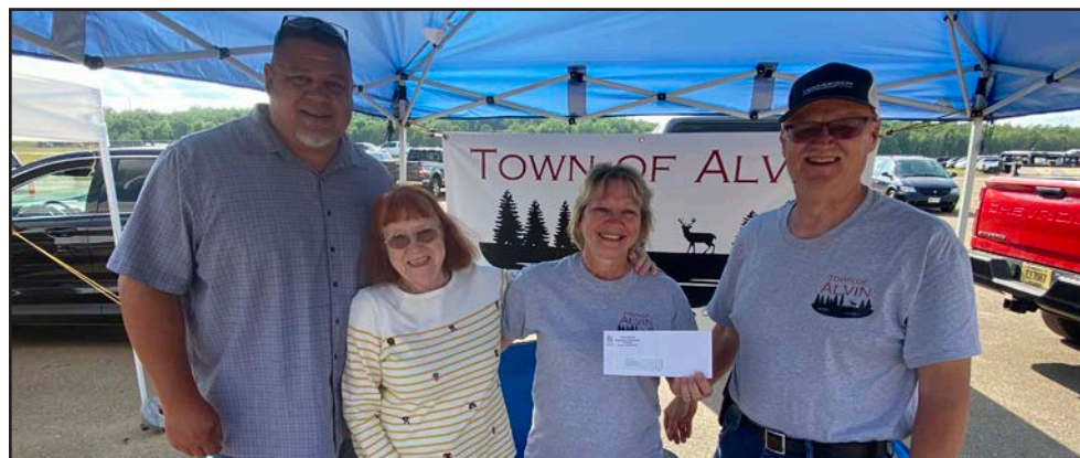
Town of Alvin: Painting and repairs to the town hall and furnace replacement