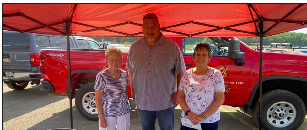
Town of Nashville: Replace roadway and road name signs with new reflective signs