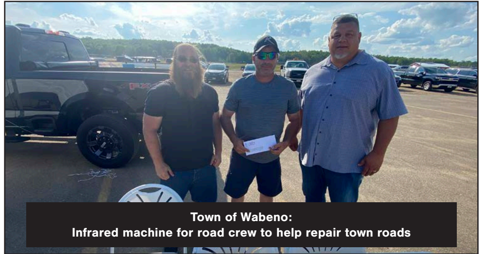
Town of Wabeno: Infrared machine for road crew to help repair town roads