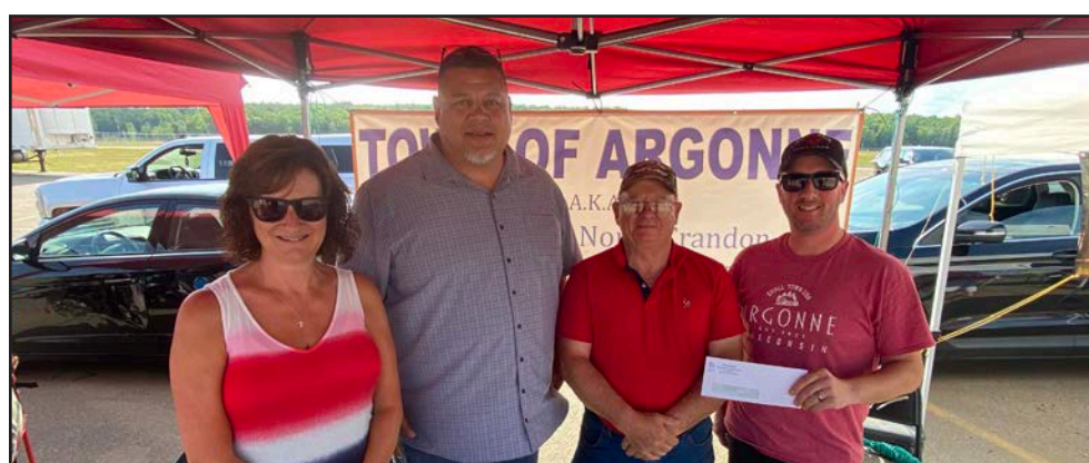
Town of Argonne: Replace and update the flooring in the town hall