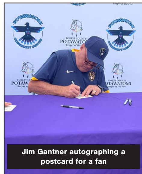
Jim Gantner autographing a postcard for a fan