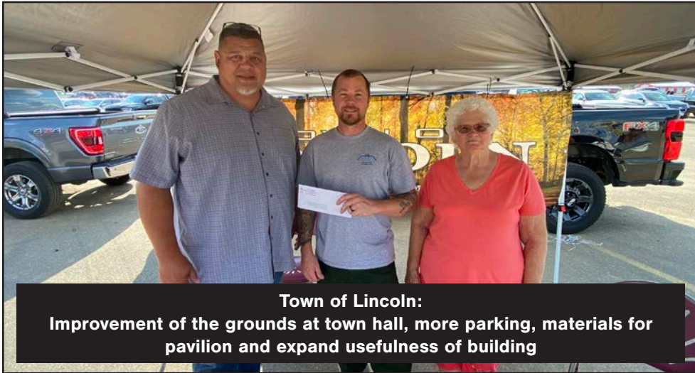
Town of Lincoln: Improvement of the grounds at town hall, more parking, materials for pavilion and expand usefulness of building