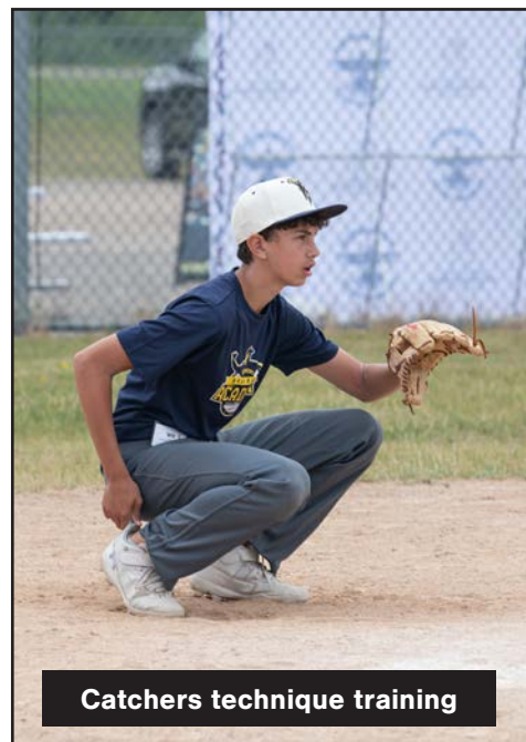
Catchers technique training