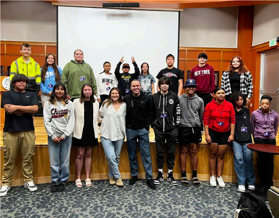
Participants and speakers at the Summer Youth Camp