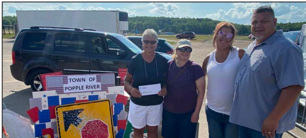
Town of Popple River: Replacement and upgrade of town signs and roadway signage