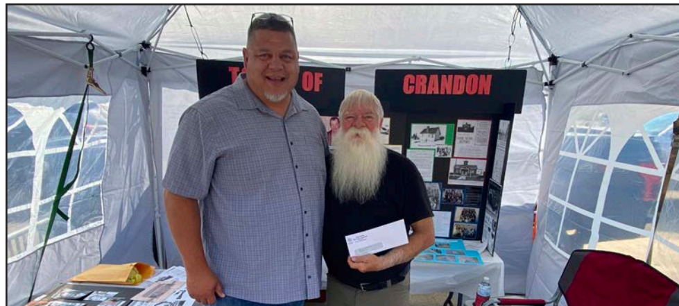
Town of Crandon: Improve boat landing on Little Rice Lake and repairing road to flowage