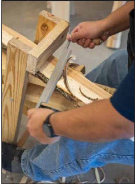
(l) Splitting the log into long sections. (r) The process of carving and shaping the wood into a stick. (below) Menomin getting further into the shaping process.