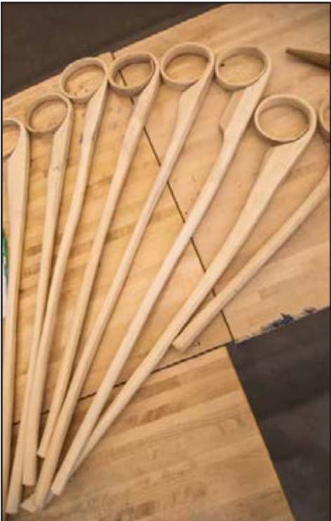
(l) Menomin & Wood Shop Supervisor Jacob Struble bending the stick after it's been steamed. (r) Some finished sticks without baskets.